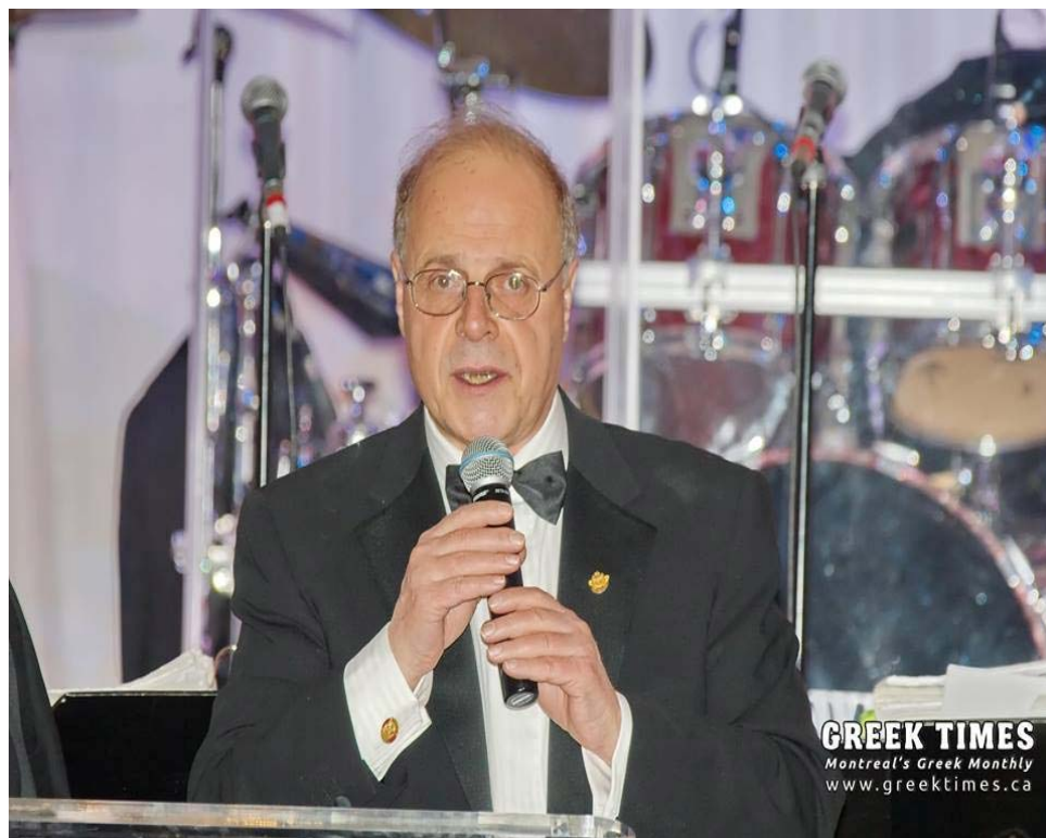
Your Canadian President addressing the 250 guests in attendance