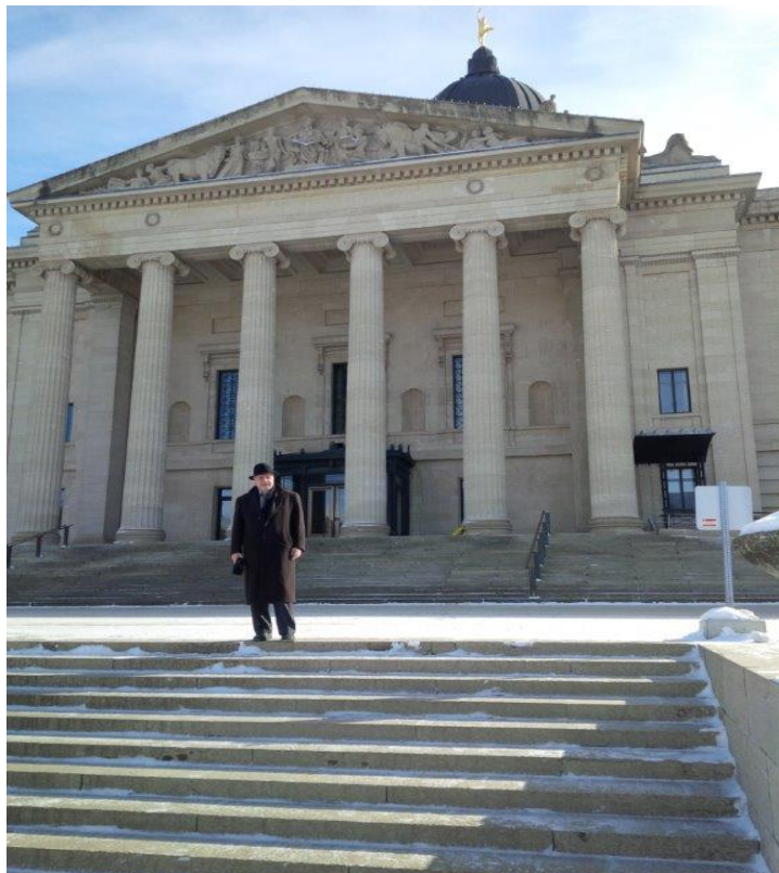
From our visit to Manitoba's beautiful neoclassical Legislative Building