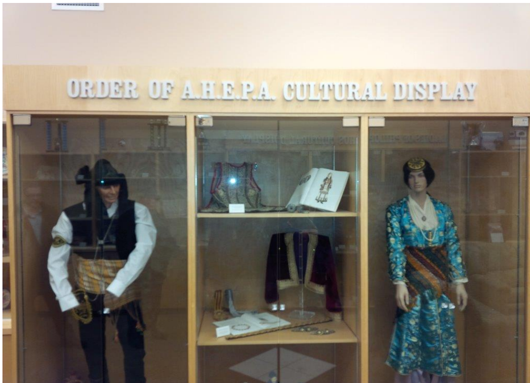
The AHEPA Winnipeg Family Raised over $100,000 towards the Winnipeg Hellenic Community Centre where it now has a cultural and archival display, office and meeting rooms. The fruits of cooperation between the Church and AHEPA.