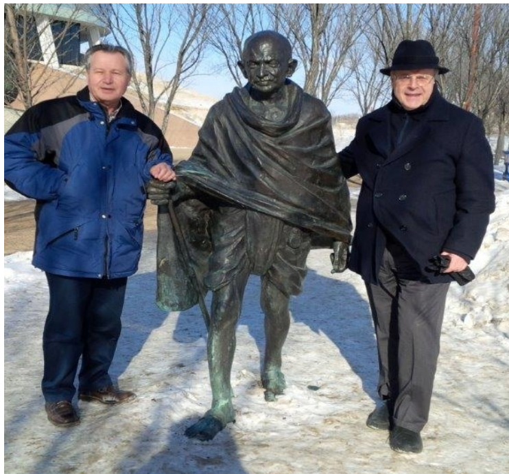
An inspirational walk with Mahatma Gandhi, outside Canada's newest museum, The Museum of Human Rights in Winnipeg, Manitoba