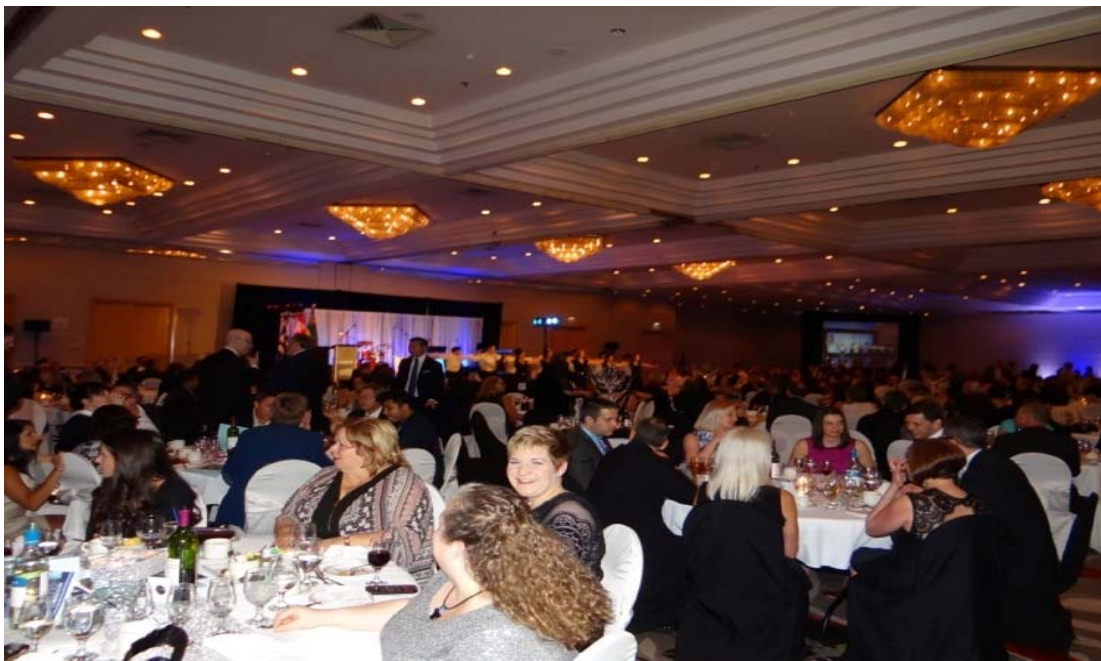
A hall bursting with over 750 attendees, a remarkable success!