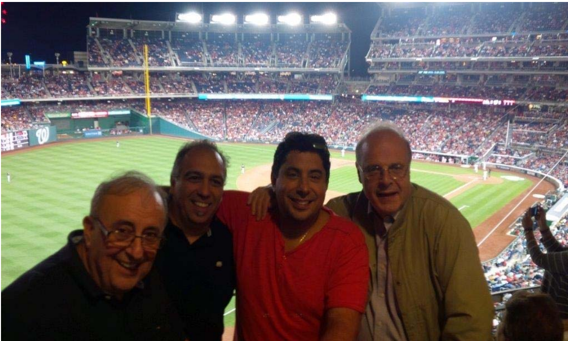
At the ball game of the Washington Nationals (formerly the Montreal Expos)