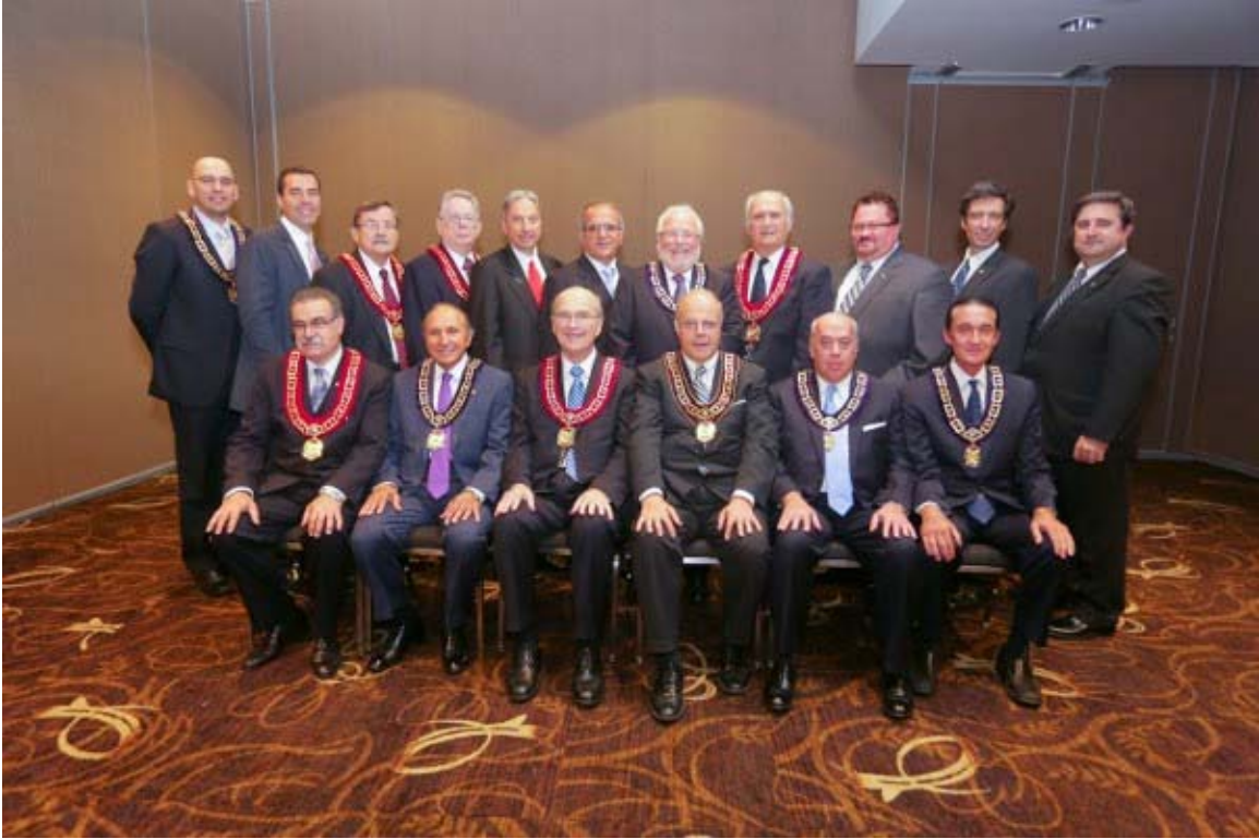
The newly elected Supreme Lodge of AHEPA for 2014-2015, New Orleans, LA, July 2014