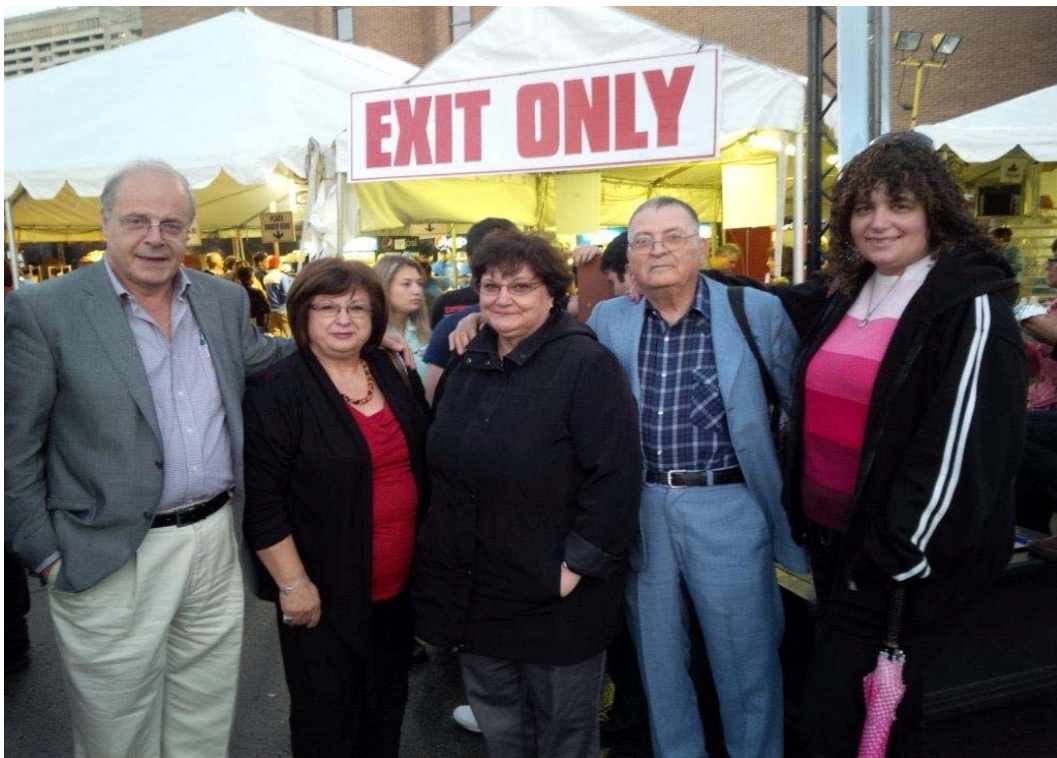
With Montreal Daughters at Ottawa Greek Fest, August 17, 2014