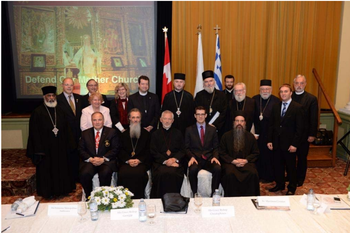
At Conference on Ecumenical Patriarchate in Toronto, October 21, 2014