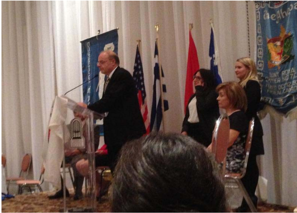
Montreal AHEPA Family Installation Ceremony, October 3, 2014