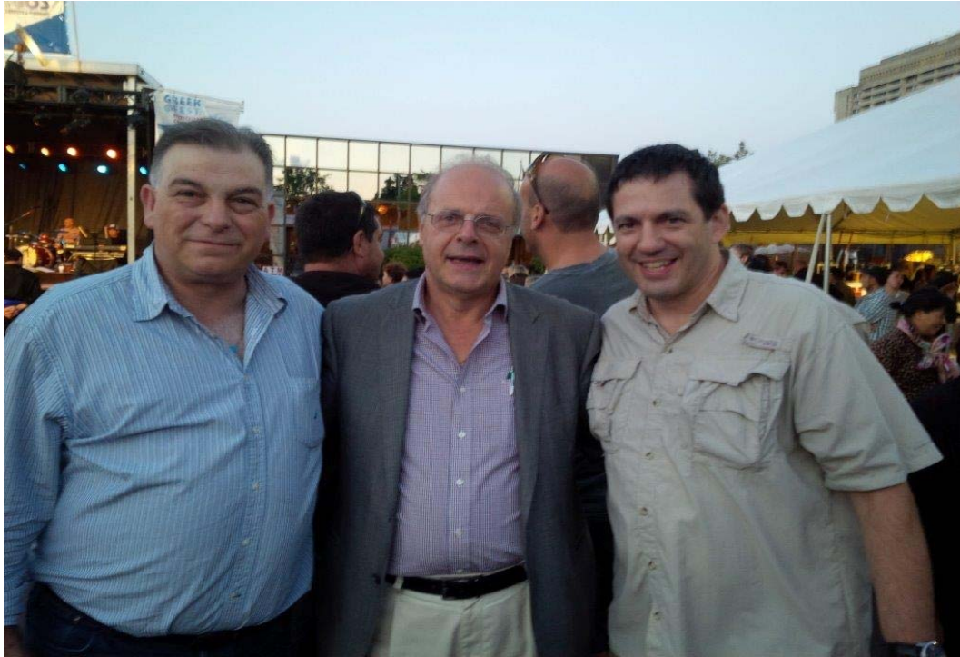
With AHEPA Chapter Brothers in Ottawa Greek Fest August 17, 2014