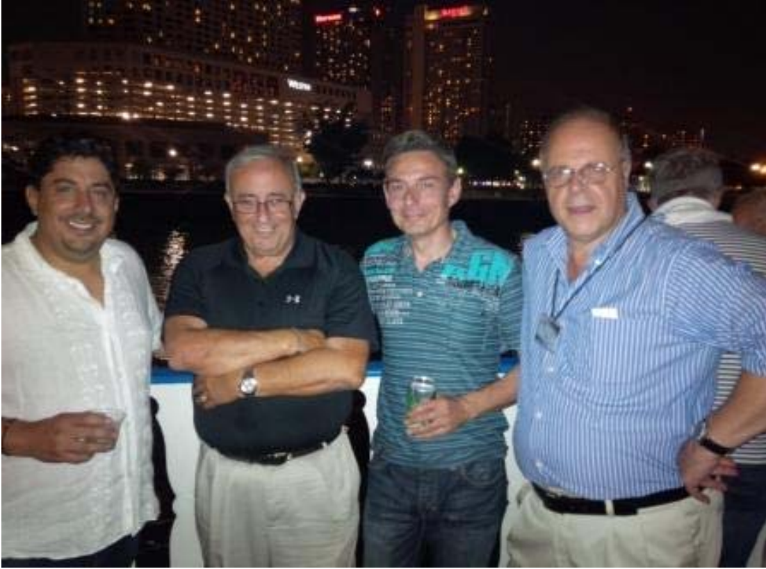
From New Orleans Supreme Convention, July 2014