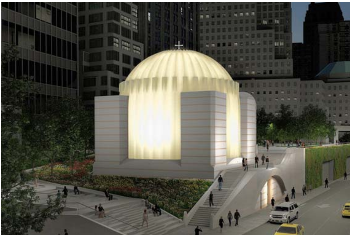
Architect's Rendition of what St-Nicholas Church and National Shrine will look like upon completion in late 2016