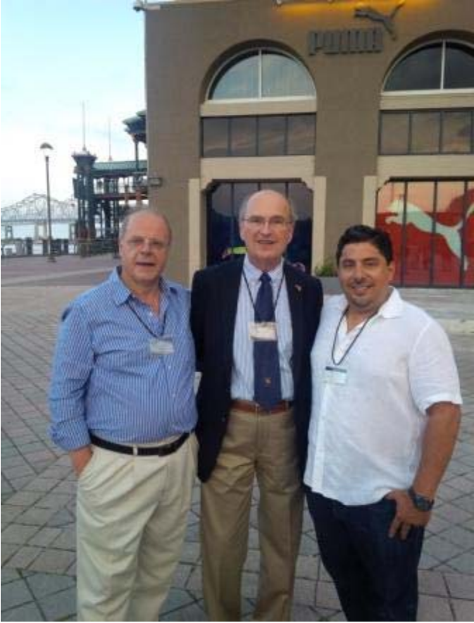
New and Past Canadian Presidents with new Supreme President in New Orleans, July 25, 2014