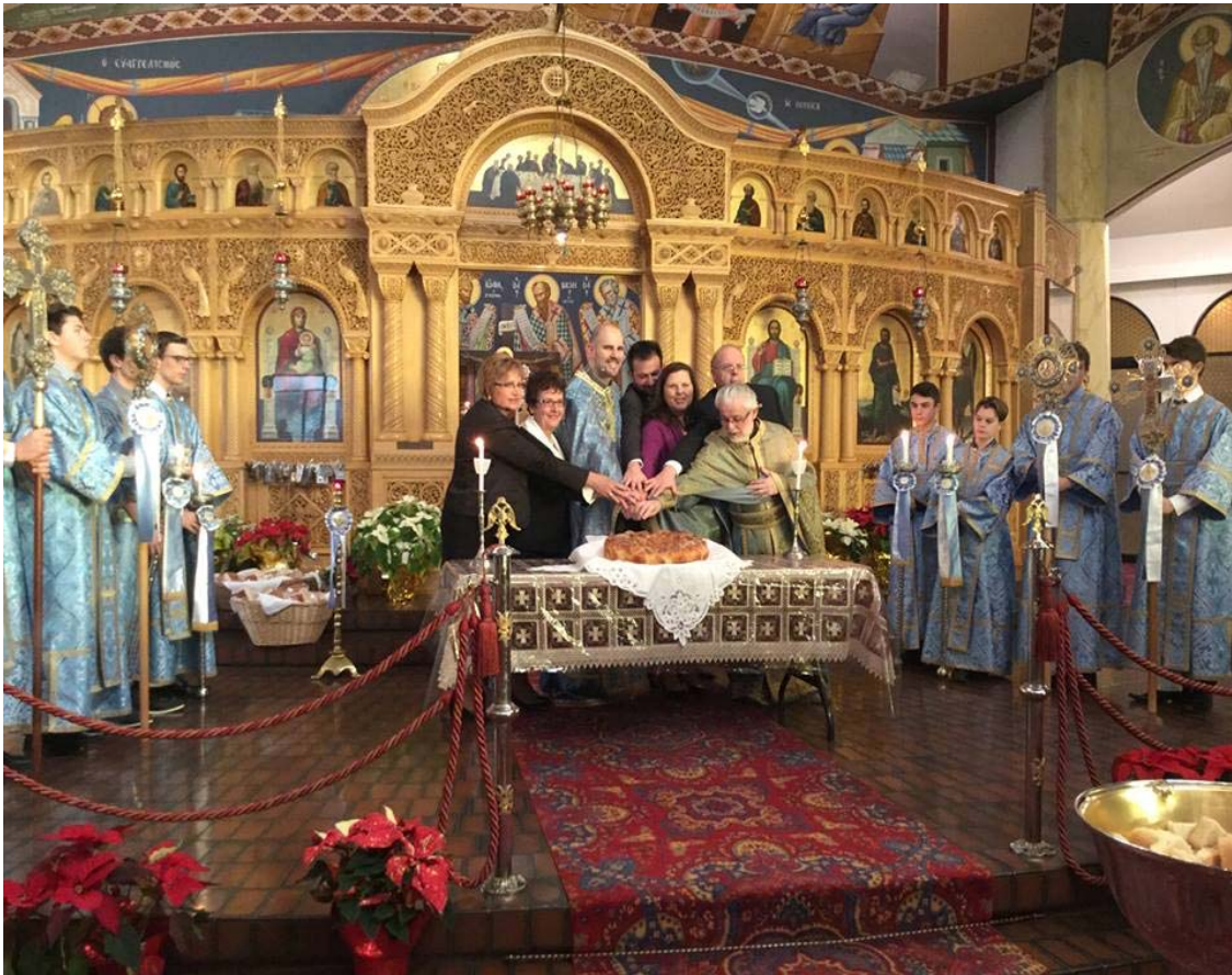
The Cutting of the Vasilopita Ceremony at Vancouver's St-George Greek Orthodox Church