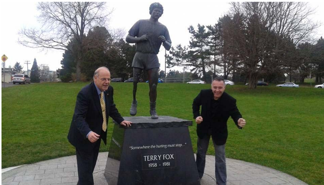
Drawing inspiration from Terry Fox to spread the AHEPA message across Canada