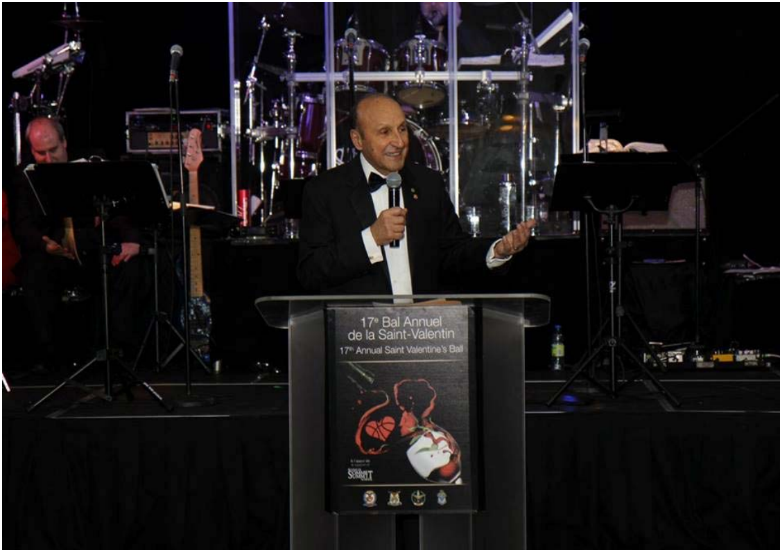
Supreme President of AHEPA addressing the guests at the Ball