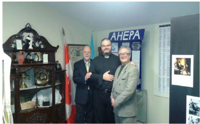
At the Cultural Museum of the Ypapanti Greek Orthodox Community in Victoria