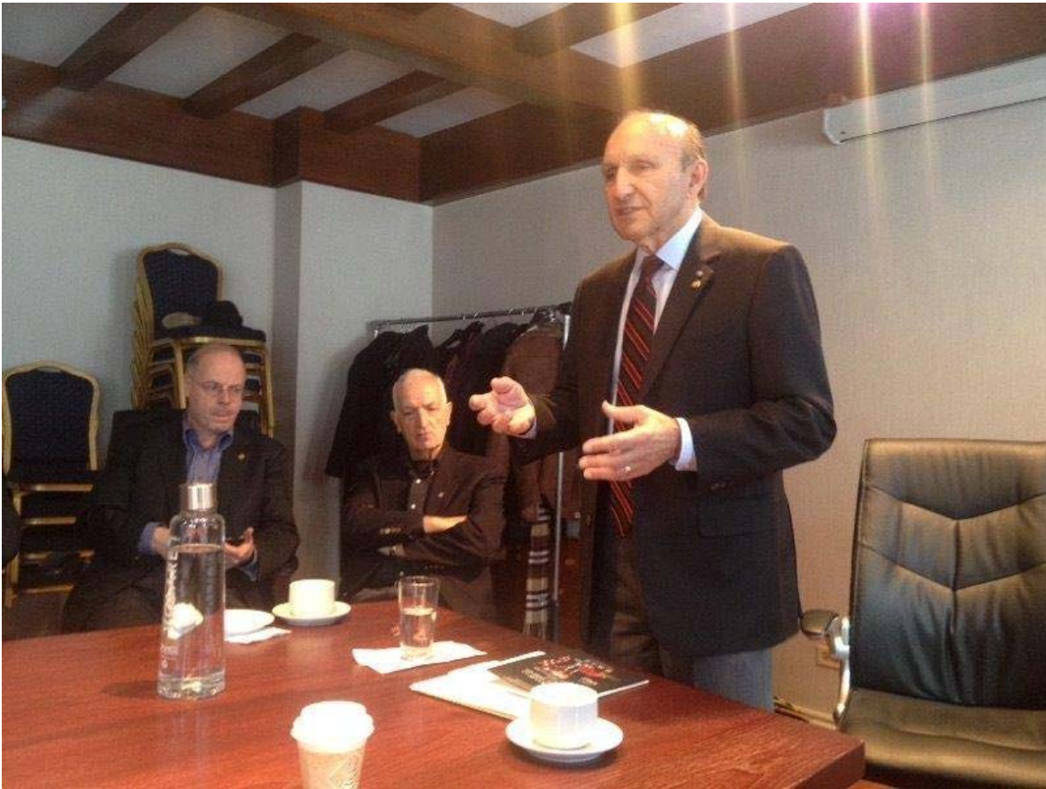
Supreme President of AHEPA holds a working session with Ahepans from District #23 in Canada.