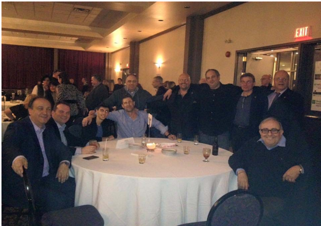
The Ottawa Brothers were joined from Brothers from Montreal, Toronto and Kitchener