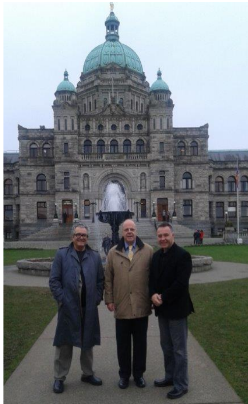
In front of the British Columbia Legislature in Victoria, B.C.