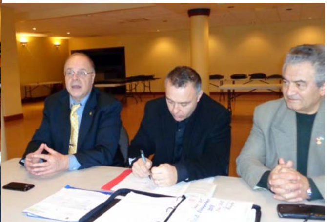
Chapter Meeting of Victoria Chapter on January 8, 2016