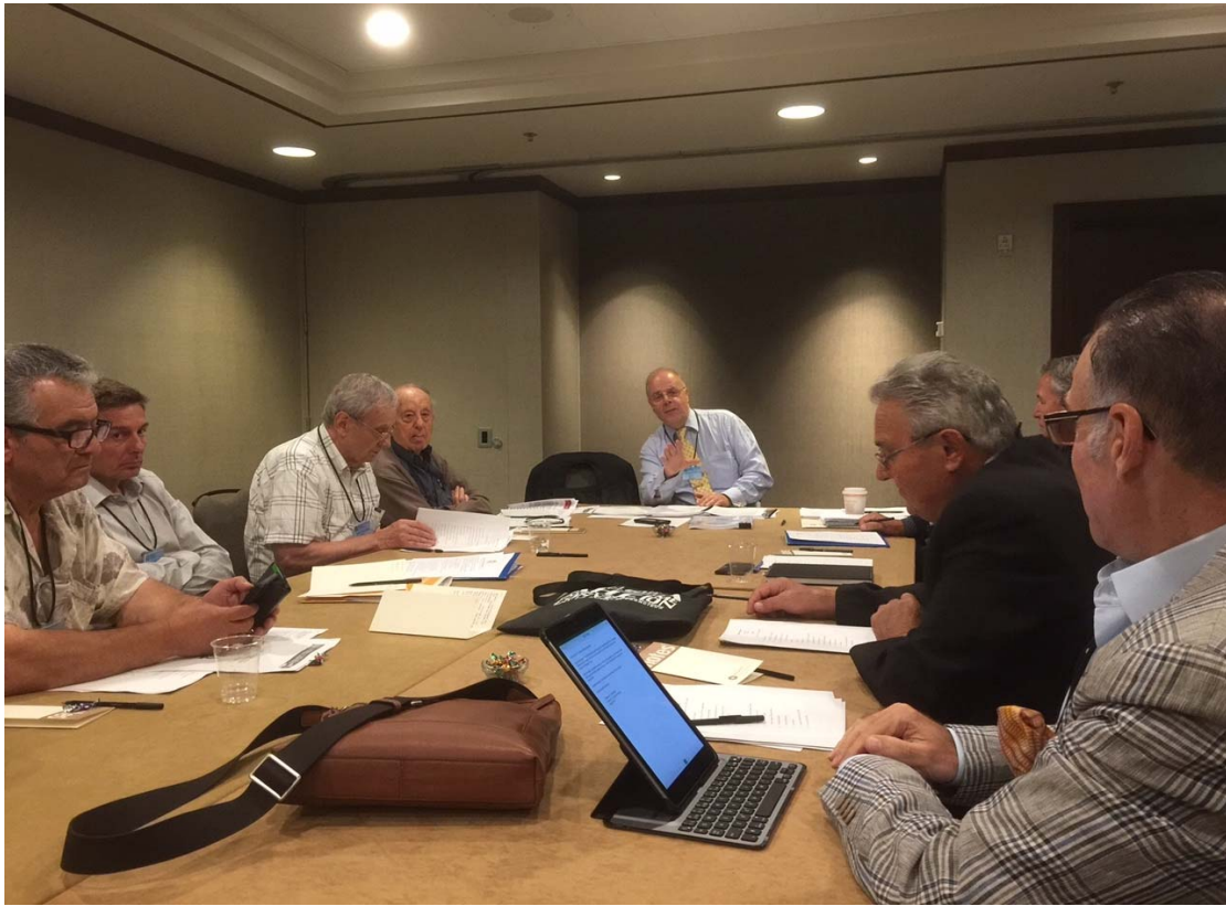
Canadian Affairs Committee Meeting at the Convention