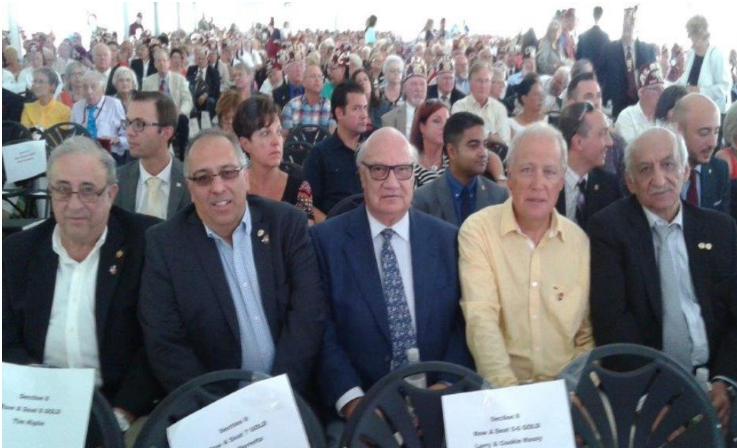
AHEPA Montreal Chapter contributed $250,000 towards this noble objective and the Shriners have named the School in the hospital the "AHEPA Family School"