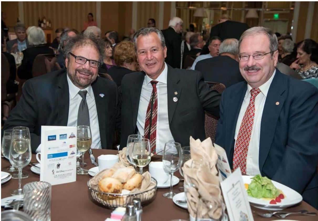
District 24 Governor Christos Argiriou seated in the center at the Convention banquet