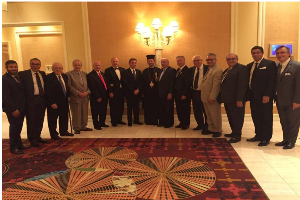
The Canadian delegation at the Supreme Convention in Las Vegas with His Eminence Metropolitan Gerasimos of San Francisco in the center