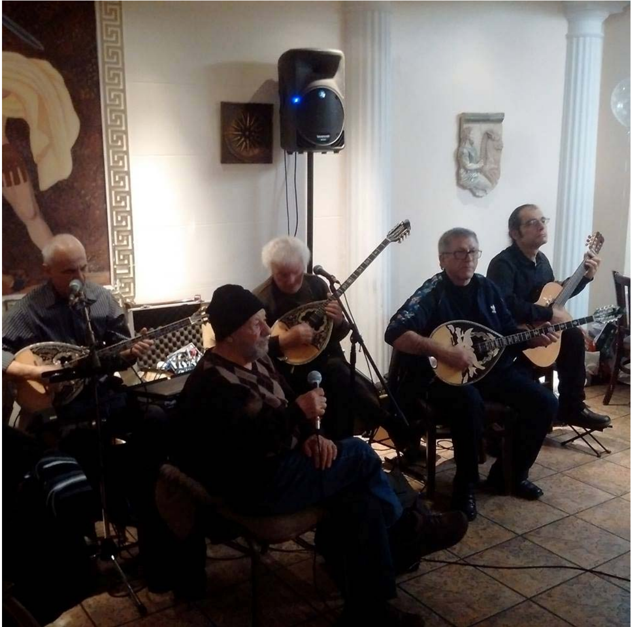
Toronto AHEPA Family Christmas Dinner, December 3, 2016