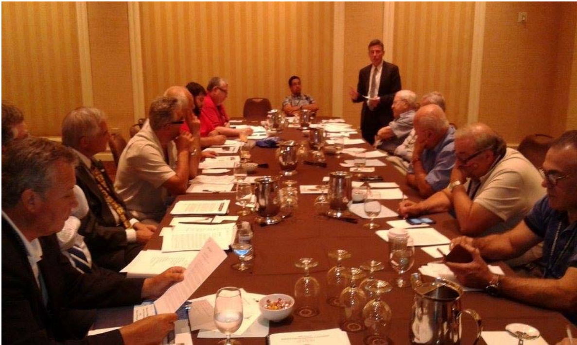
From the deliberations of the Canadian Affairs Committee at the Supreme Convention