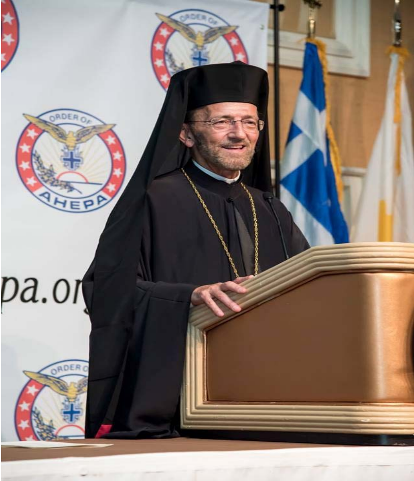
His Eminence Metropolitan Gerasimos of San Francisco addressing the Banquet delegates